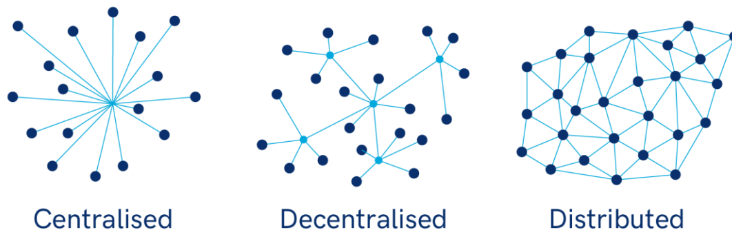
Figure 1: Centralised Databases vs Distributed Databases such as Blockchain